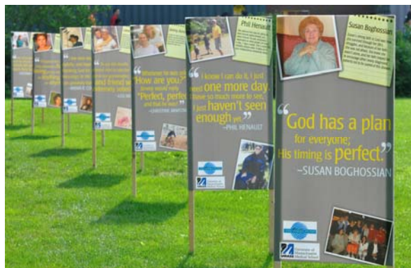
The "Many Faces of ALS" posters.

All money raised for the event is directed to research at UMASS Medical School toward finding a cure for ALS. This year the event reached the $1 million fundraising milestone since the inception of the run in 2004. This year alone the event grossed approximately $175,000 and the net donation was approximately $132,500.